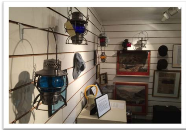
Inside huge safe, more PRR history is nicely displayed.