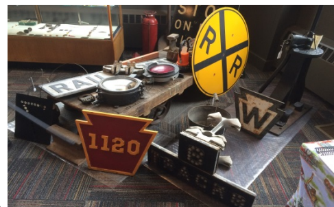
The Bradford R.R. Museum.

The Lines West-Buckeye Chapter summer meeting was held in June 2016 in Bradford Ohio in conjunction with The Bradford R.R. Museum Festival. (2016 Railroad Heritage Festival) They have done an excellent job with museum updates, plus they have restored the PRR Bradford Tower.