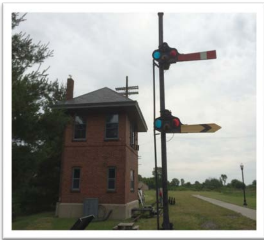
"BF Tower" is well well-preserved in Bradford PRR history.